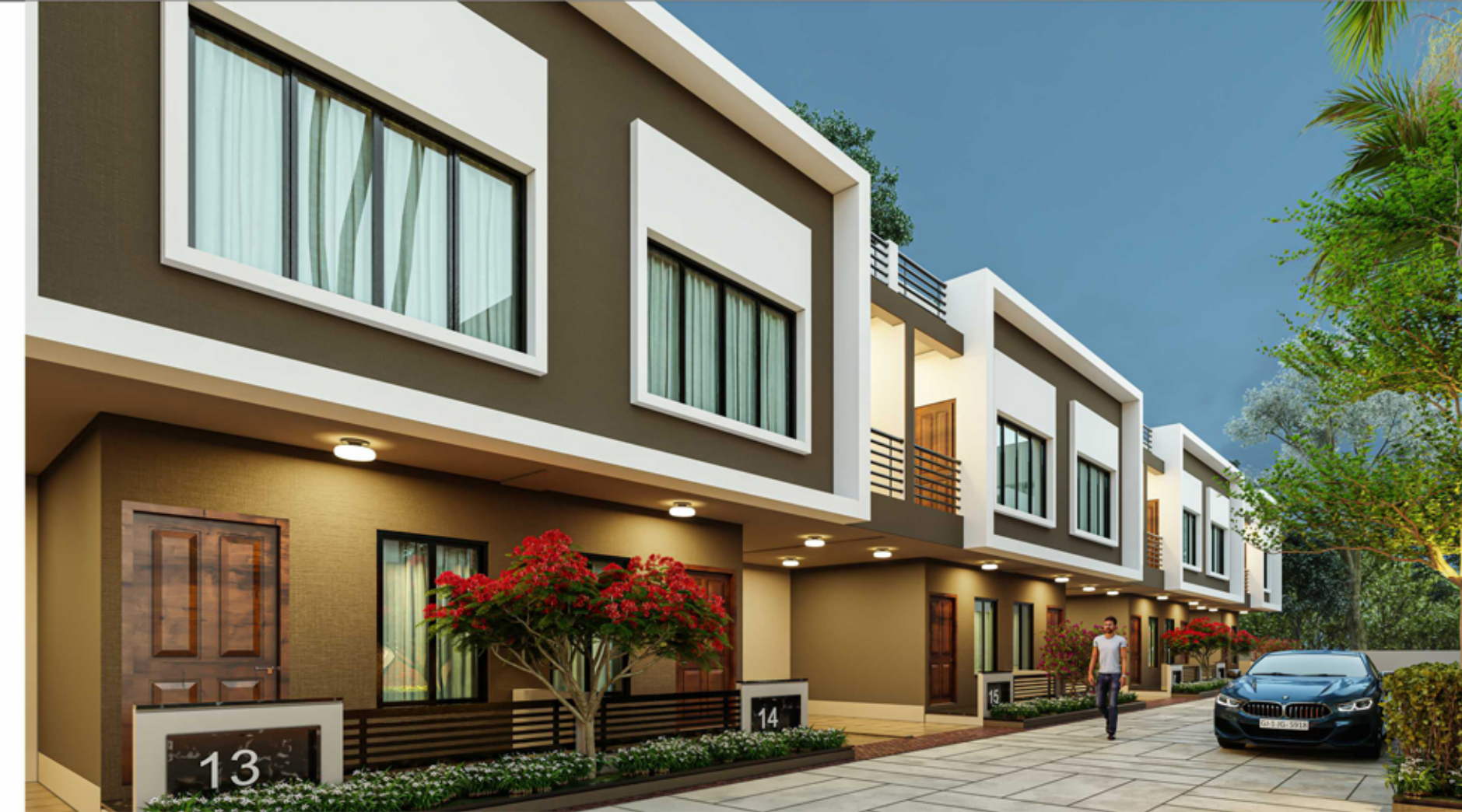
4BHK Bungalow, Geratour