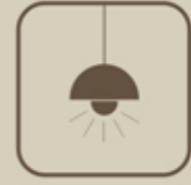
Under Ground Electric