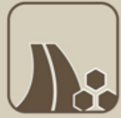
All Internal RCC Road