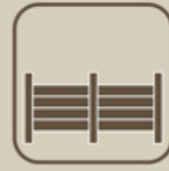
Society Compound Wall