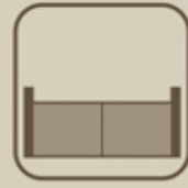
Attractive Main Gate